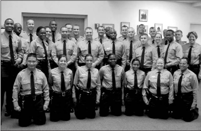
Cincinnati Police Department 99th Recruit Class

Their curriculum is an intensive 24 weeks of classroom, practical and physical training. Those who successfully complete the training will be commissioned at the March 10, 2006, graduation ceremony.